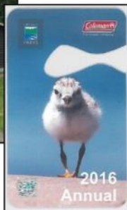
2017 Annual Pass