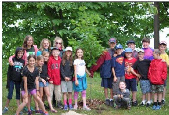
Some campers, 2015

For more information, please e-mail us at kidsn.nature@friendsofpresquile.on.ca , visit www.friendsofpresquile.on.ca , or call 613-475-1688 ext. 3 .