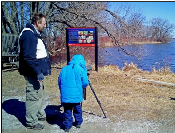
Spotting waterfowl with a Friend