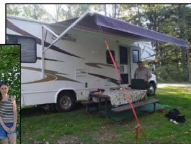
Camping on a hydro site in Presqu'ile