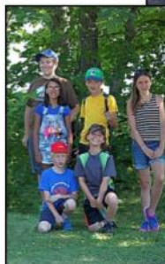
Kids 'n Nature Summer Camp 2017