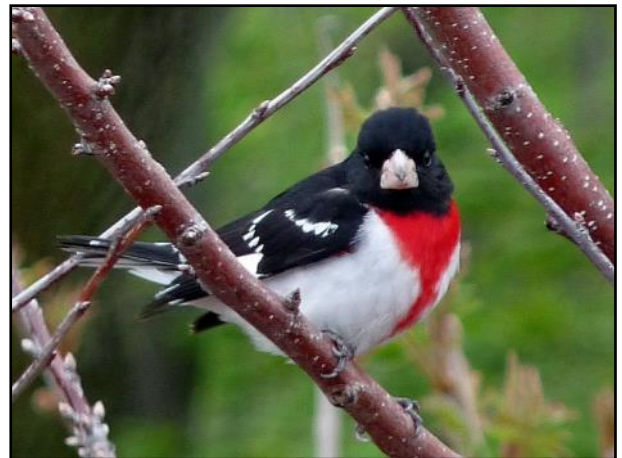
Rose-breasted Grosbeaks are just one of the 100+ species of birds that migrate through Presqu'ile in May

In addition to migrating birds moving through this area, some of these birds coming in call the Park home for the summer and should be starting their nest-building activities by this weekend. Warbling Vireo, Purple Martins, Redstarts, and Baltimore Orioles, to name just a few, usually have nests around the lighthouse and we can usually find some.