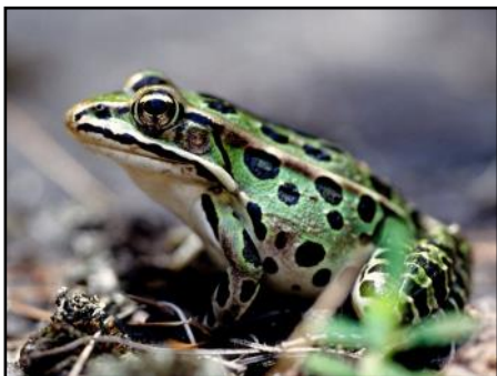
Leopard Frogs and other species will benefit from the wildlife tunnels.

In the December 2015 edition of The Beacon, we reported that installation of the first tunnel had begun. Since then, the second tunnel has been installed.