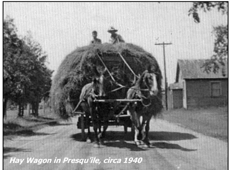
Hay Wagon in Presqu'ile, circa 1940

However, in this, the 21 st century, it is a very different scenario. The impact of people on nature in this day and age is dramatic, with over 200,000 Park visitors and with services being provided to the many cottages and now permanent residents on Presqu'ile Point. This once